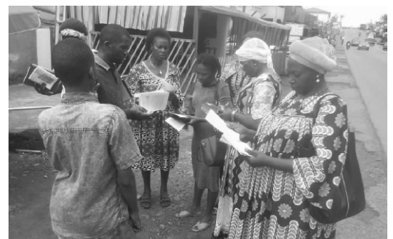
HOUSE TO HOUSE EVANGELISM IN CAMEROON