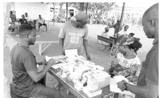
MEDICAL OUTREACH IN NORTHERN GHANA